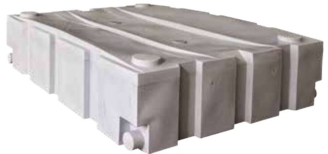
FORMIT WASTE TANK 2000L (NO FRAME)